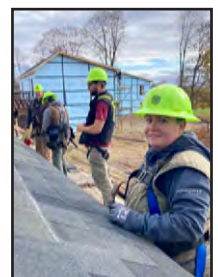
PV2 on the Victoria Bismark Farm site