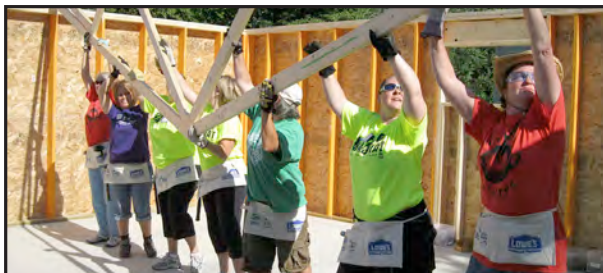
Women Build teamwork