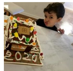
First gingerbread house!

"I couldn't ask for anything more," Hamid says.