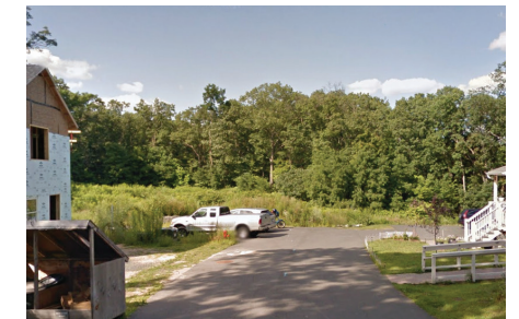
Future home site, 1 Garfield Ave.