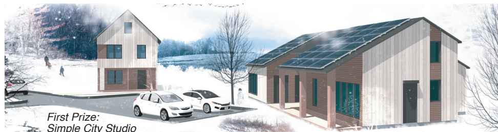
First Prize: Simple City Studio

PS – While we enjoy looking to the future, we are still building in Amherst and Greenfield now, and planning for projects to break ground in Northampton in 2018! Come lend a hand.